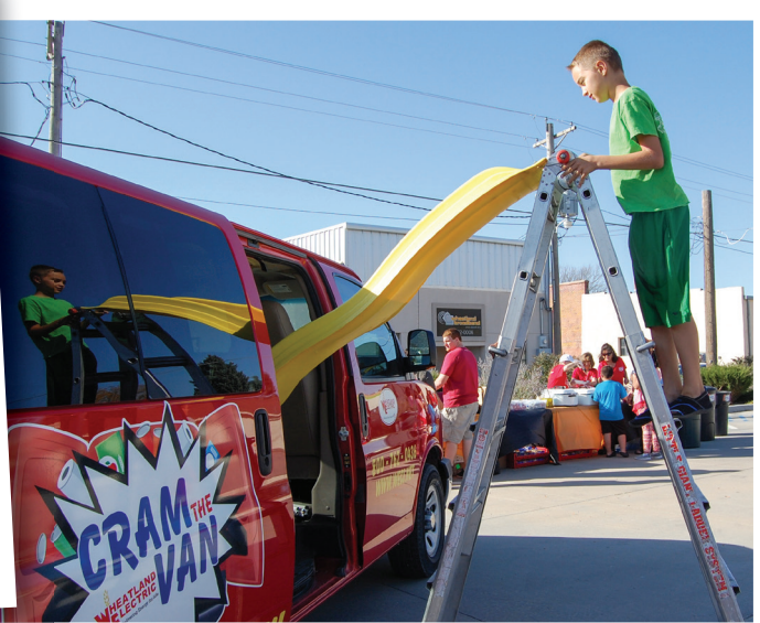
Our fall finale includes a food slide where kids can slide their donations right into the van.